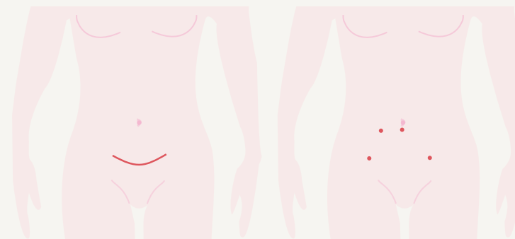
Open Myomectomy Incision

A common alternative to hysterectomy is myomectomy — or surgical removal of uterine fibroids. This procedure preserves the uterus, and may be recommended for women who could become pregnant. Myomectomy is often performed through a large abdominal incision. After removing each fibroid, the surgeon carefully repairs the uterus, to minimize potential bleeding, infection and scarring. Proper repair of the uterus is critical to reducing the risk of uterine rupture during pregnancy.