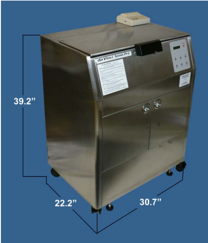
Front view of daVinci® SonicPro™ Cleaning System