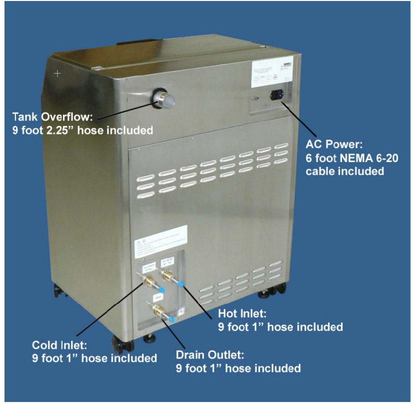
Rear view of daVinci® SonicPro™ Cleaning System